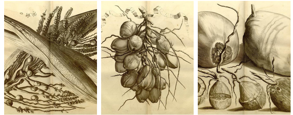
02 Two plates following each other in Volume 1 show a bunch of flowers with florets at varying stages of growth—buds, newly-opened flowers, young fruit, and an inset showing details of the developing ovary, calyx, and petals. The third plate shows the immature coconut fruit in its green outer casing followed by close-ups of the mature drupe with and without its hard, inner casing.